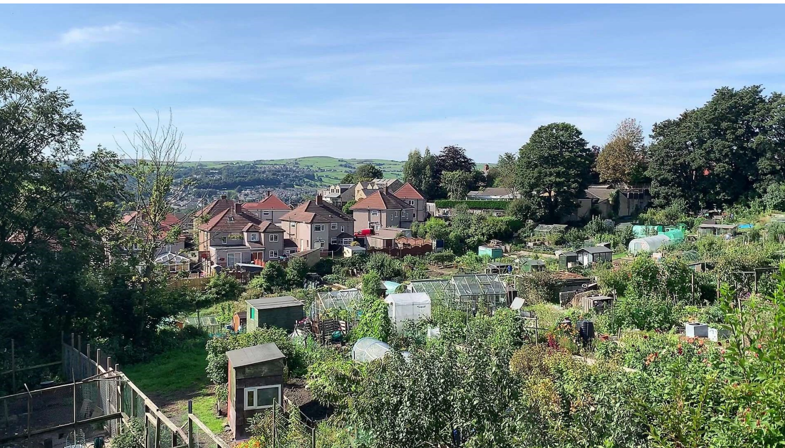
VIEW FROM THE BUILDING PLOT